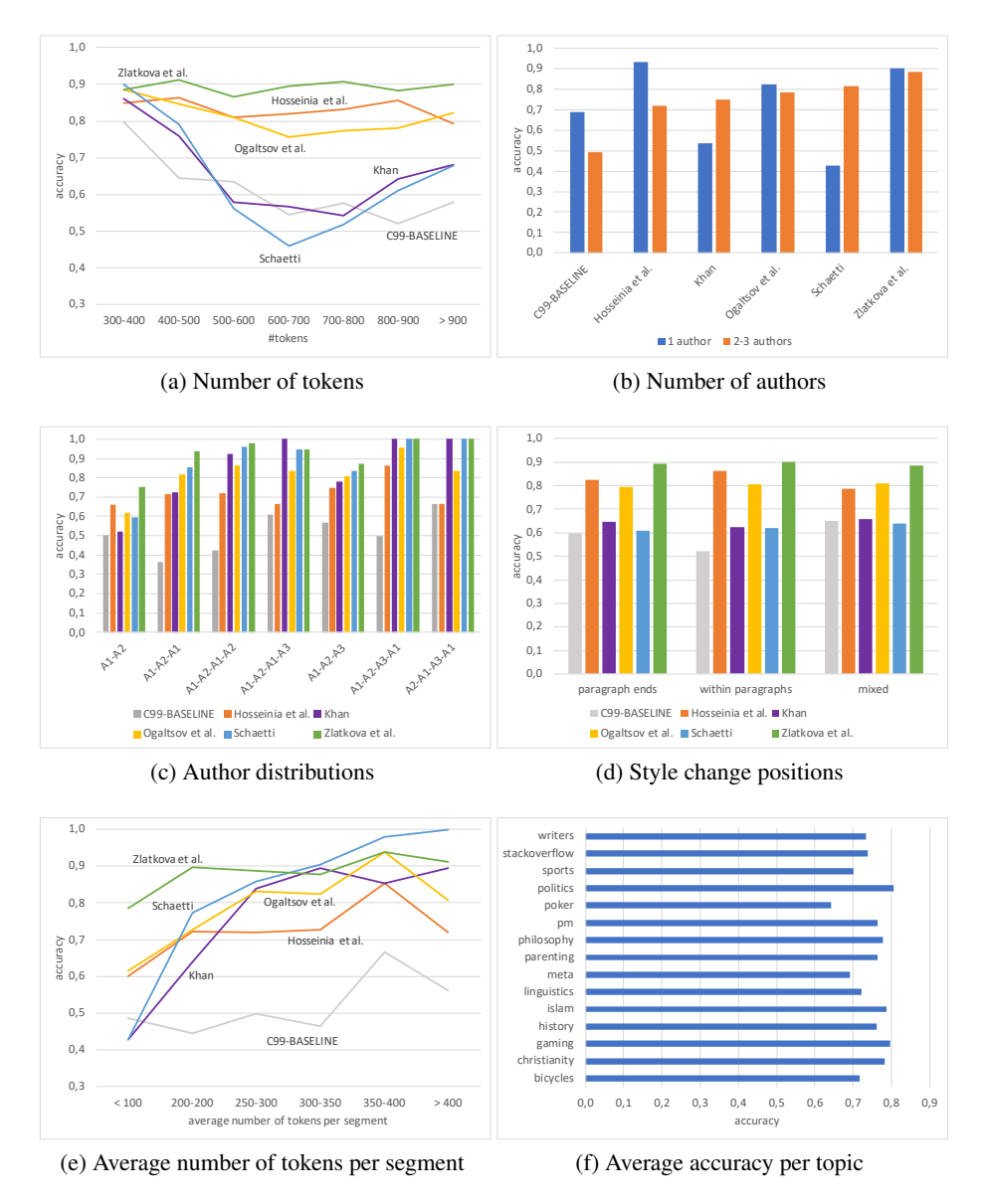
Figure 2. Detailed evaluation results of the style change detection approaches with respect to various parameters.

the results. All submitted approaches are insensitive to the style change position as can be seen from Figure 2d. Thus, it is irrelevant for the respective algorithms if authors switch only at the end of paragraphs or anywhere else. Compared to the results of the previous year's style breach detection task [50] this can be seen as an enhancement, as