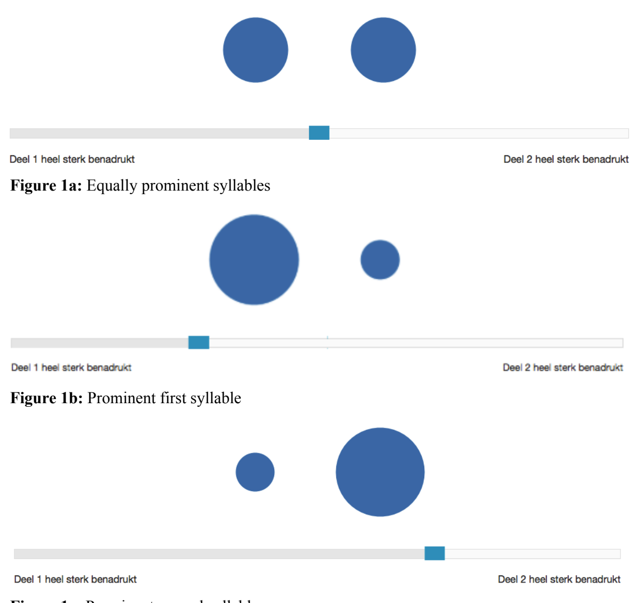
Figure 1c: Prominent second syllable

Figure 1: Print screen of three different rating positions on the sliding bar. Legend: "Deel 1/2 heel sterk benadrukt" = "Part 1/2 very strongly emphasised"